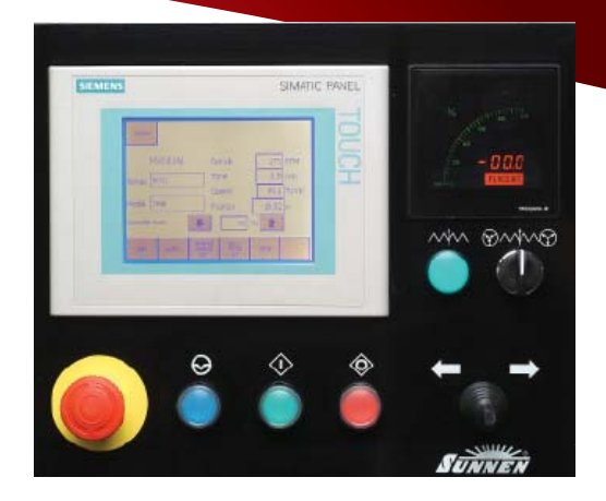
Easy-to-read PLC touchscreen display simplifies setups and operation.